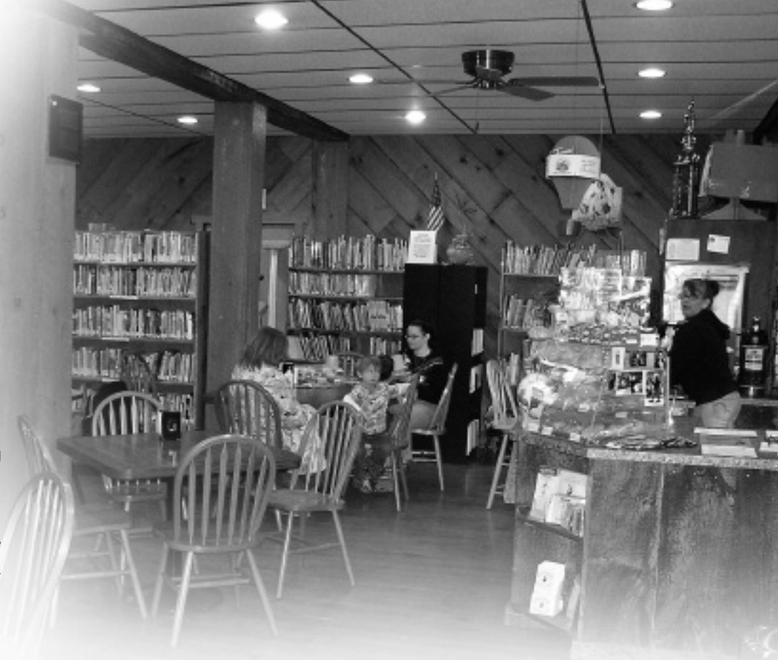
Shown above is a glimpse of the new Main Street Coffee Works and the temporary library. The partnership has enabled the library to follow the hours of the coffee shop, offering services for longer hours each week.

The library has packed up and moved down the block to its new temporary home in the historic Canal Depot building. We are now sharing space with Main Street Coffeeworks and Diamond Seafood, thanks to the forward thinking co-owners, Henry and Daphne Straub. Patrons of the coffee shop can now enjoy looking at books and magazines while sipping their coffee and munching on lunch; likewise, library patrons can pick up coffee, cold beverages and food while checking out books and materials. It is a great blend of services and everyone walking through the doors seems genuinely pleased with the atmosphere and set up. Library hours now coincide with coffee shop hours, even though library staff is not necessarily always available. To overcome that obstacle, the library Board decided to offer an honor system of self-service check out for anyone who has a library card. The library's computers are set up and functioning, offering a real "internet cafe" experience. Stop by to see us today!